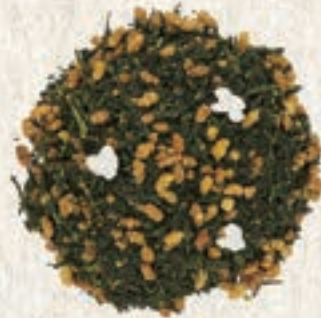
玄米茶 Genmaicha Roasted Rice