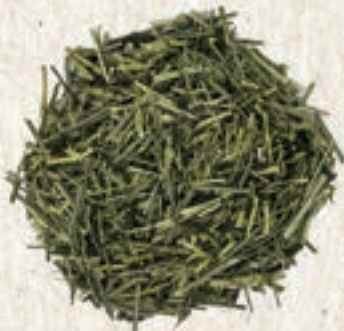
レモングラス緑茶 Lemongrass Green Tea