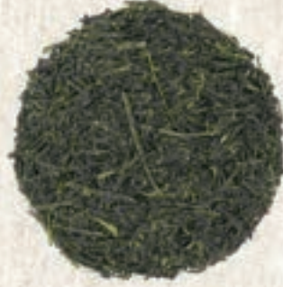
ゆたかみどり煎茶 Yutaka Midori Sencha