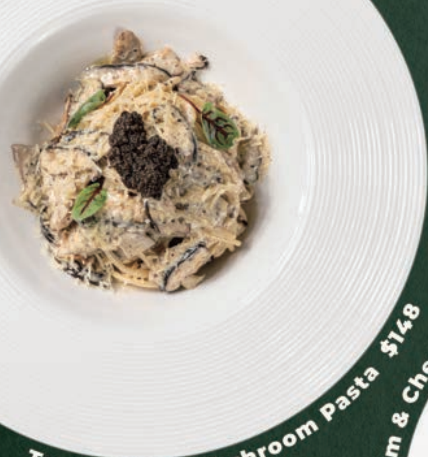
Truffle Wild-Mushroom pasta $148