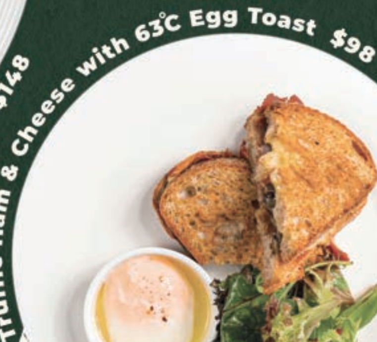
Truffle Ham & Cheese with 63°C Egg Toast $98