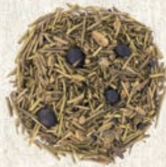
黒豆ほうじ茶 Black Bean Hojicha