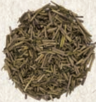
ほうじ棒茶 Hojibo Roasted Tea